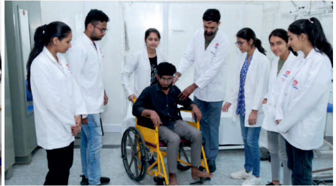
MGH Physiotherapy Labs