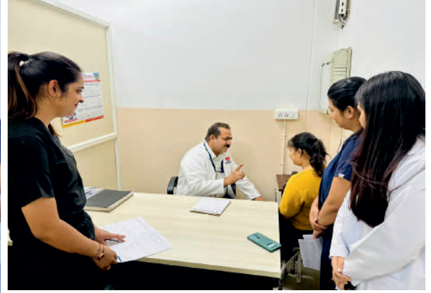
MGH Physiotherapy OPD